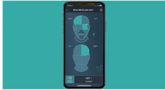
Mobile App: Migraine Buddy