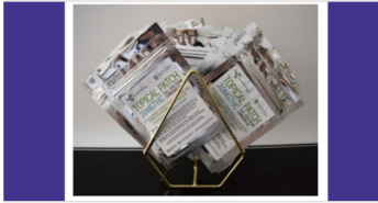
New Cannabis Patch For Fibromyalgia And Nerve Pain

GammaCore: FDA Cleared Wearable for Migraine Pain